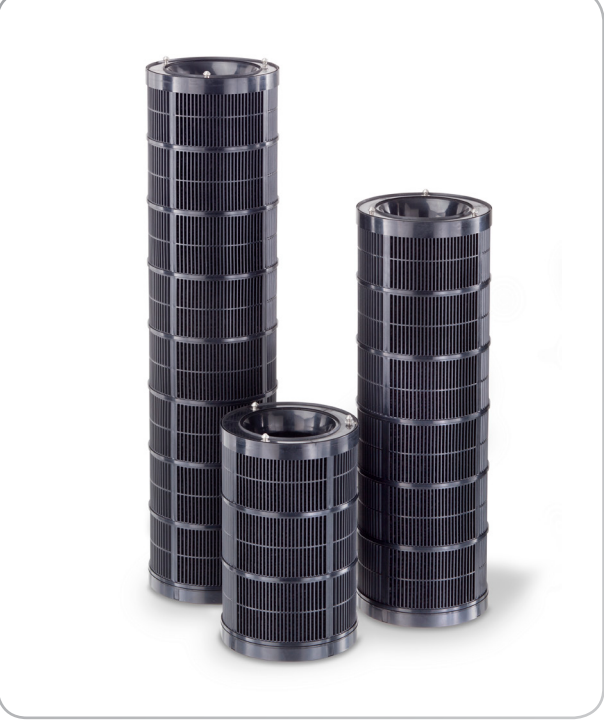
10", 18" and 24" lengths shown. 10" (reduced capacity) only available by special order, contact factory.

Refillable high capacity molecular cylinders remove offensive gaseous contaminants or reduce expenses associated with ventilation air.